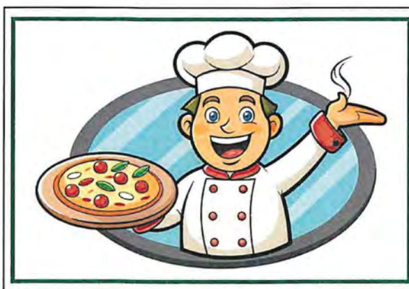
Plate of Pizza Slices Salad Bar Dessert Bar Milk, Water

Available Pizzas: Cheese, Sausage, Pepperoni and Supreme